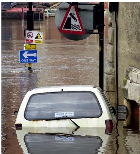
Flooding in Yorkshire in the late 90s

Controversy over the willingness of local authorities to adopt sustainable urban drainage techniques shows just how important the issue of source control has become. Now, for a number of councils, a technological breakthrough has made the use of SUDS as practical as conventional flood prevention techniques.