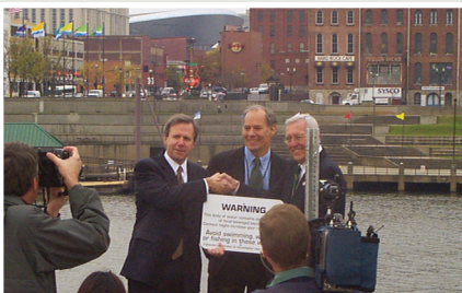
Nashville celebrates the removal of the Cumberland River from the 303(d) list with (from l. to r.) Mayor Bill Purcell, past Tennessee Deputy Governor Justin Wilson, and past Governor Don Sundquist.

ADS installed 100 flow monitors in 1990 following the EPA's issuance of a consent decree to the City of Nashville. The flow data gathered from these monitors and analyzed by ADS Environmental Services is delivered through electronic reports on a monthly basis. This provides the City of Nashville with Underground Intelligence that allows them to proactively manage their collection system by identifying and addressing I/I problems before they turn into overflows.