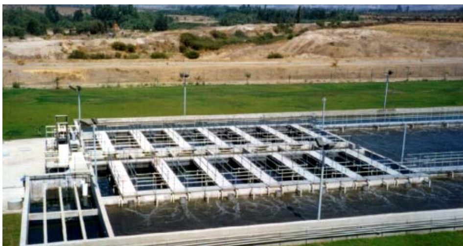
The ClarAtor clarifier equipment is installed into concrete tankage, utilizing common-wall aeration basin construction, helping to lower capital and construction costs.

ClarAtor clarifier technology is the latest in patented clarifier innovation. It features no moving parts below the water, a uniform distribution of the influent and collection of the effluent, and the unique ability to regulate the effluent flow rate. It is applicable to municipal and industrial biological wastewater treatment plants.